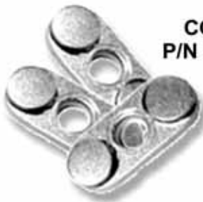
CONTACT P/N 962C526-1

FAA AND AIRLINE APPROVED REPAIR PROCESS FOR INDIVIDUAL CONTACTS AND RELAY ASSEMBLIES